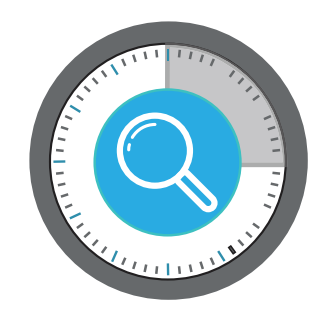
Time Slice Event Search Intelligent Event Snapshot Search functionality