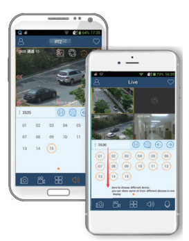
Tablet and Smart Phone Applications