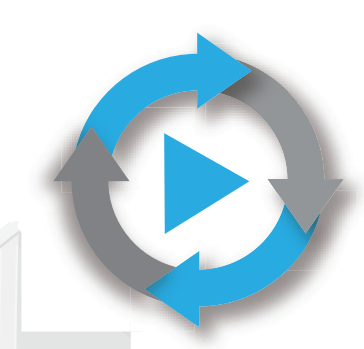
Seamless Transitions from playback to backup